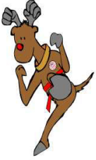
RUDOLPH THE RED BELLY REINDEER!